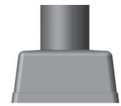
Standard Base Cover